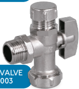
TRI-TEC VALVE MALE I3003