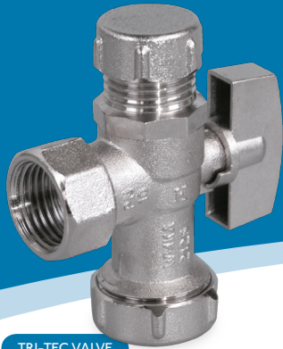
TRI-TEC VALVE FEMALE I3004

The new Tri-Tec valve from Plastec is the simplest, quickest and most cost effective way to coordinate your hot and cold water connections underneath the kitchen sink. The Tri-Tec valve simply screws onto a standard 1/2 inch mains water inlet connection and once connected allows for both the kitchen sink mixer and dishwasher to be connected directly onto the valve. If there is no dishwasher to connect then simply leave this connection capped off for future use. The valve has an isolation handle which allows for easy maintenance of any fixtures connected to the valve.