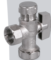
TRI-TEC VALVE FEMALE 13004

The Tri-Tec valve is fully watermark approved and available at all leading plumbing suppliers