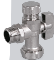
TRI-TEC VALVE MALE 13003