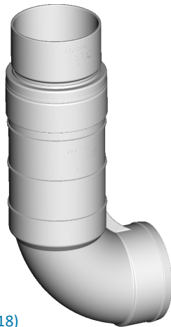
88 Degrees (17317 & 17318)