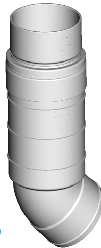
45 Degrees (17319 & 17320)